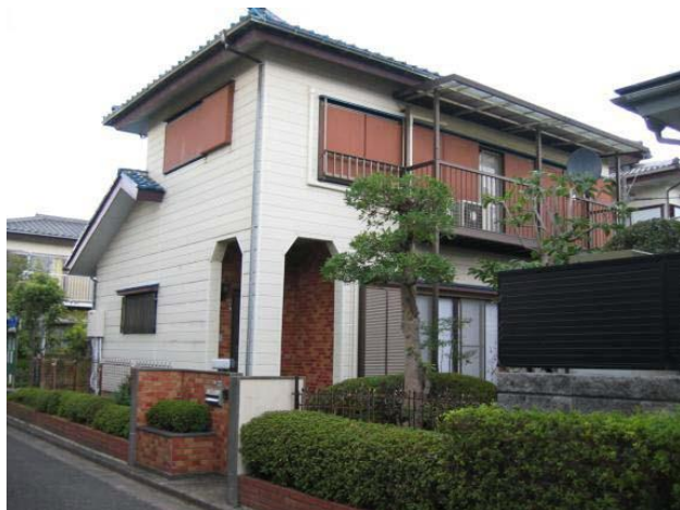
--Example of an off-base house in Mabari Kaigan

For an explanation about dealing with rental agents, up-front costs, and many other details, see websites below: